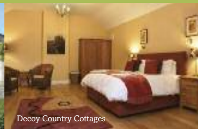
Decoy Country Cottages