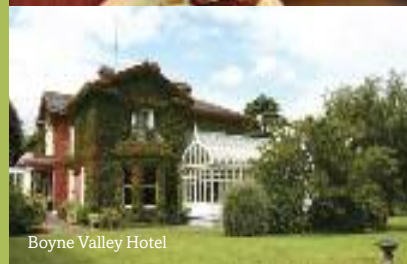
Boyne Valley Hotel