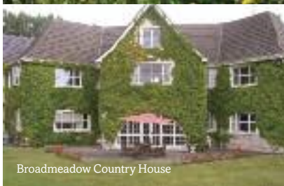
Broadmeadow Country House