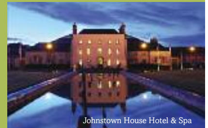
Johnstown House Hotel & Spa

The Yellow House Navan +353 (0) 46 907 3338 theyellowhouse.ie