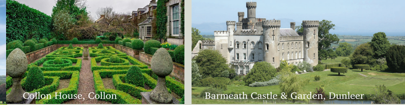
Collon House, Collon