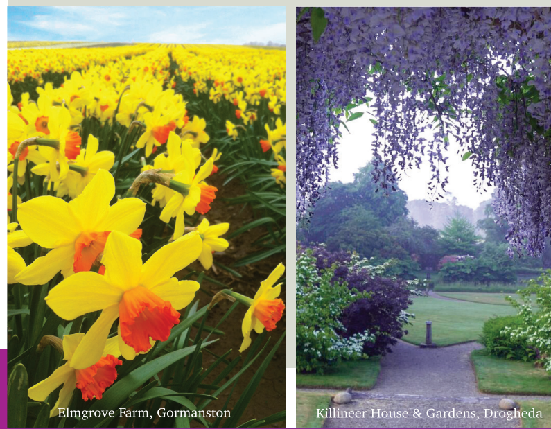
Elmgrove Farm, Gormanston