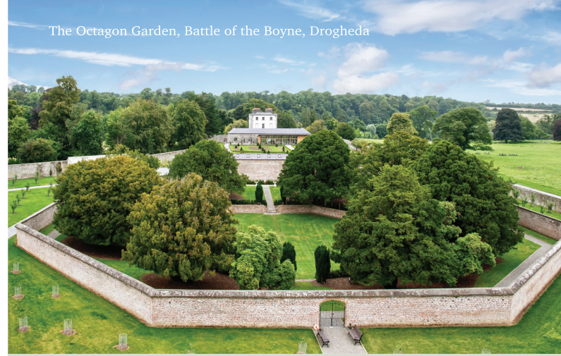
The Octagon Garden, Battle of the Boyne, Drogheda