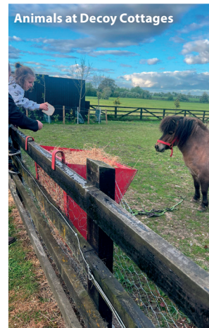
Animals at Decoy Cottages