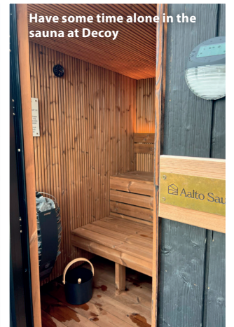
Have some time alone in the sauna at Decoy