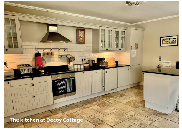
The kitchen at Decoy Cottage