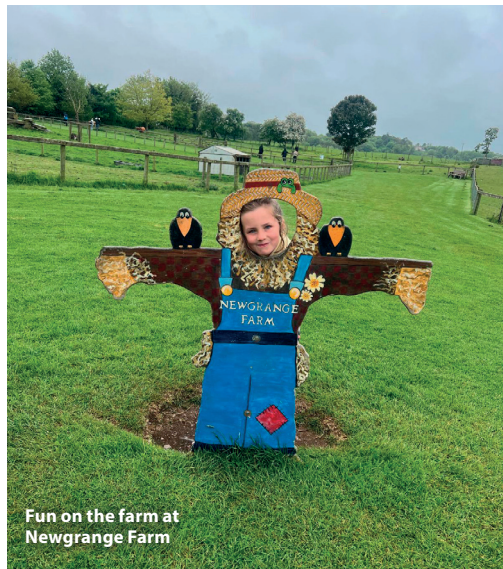
Fun on the farm at Newgrange Farm