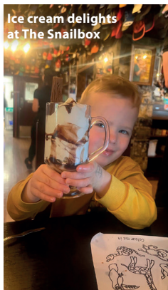
Ice cream delights at The Snailbox