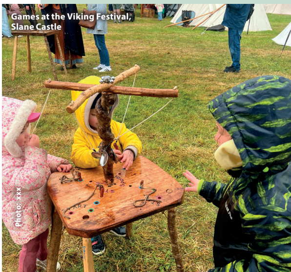
Games at the Viking Festival, Slane Castle

For more information on the Boyne Valley attractions, accommodation and dining options, go to discoverboynevalley.ie