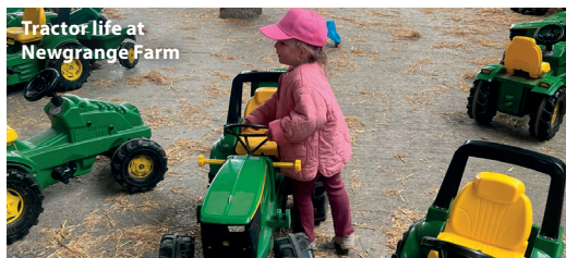
Tractor life at Newgrange Farm