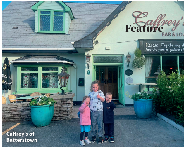
Caffrey's of Batterstown