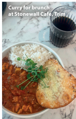
Curry for brunch at Stonewall Cafe, Trim

This festival is a brilliant day out for adults and families and is growing bigger every year. Your family ticket includes two children and carparking, making it excellent value for a full day's entertainment. Over 500 reenactors come to meet at the famous location, exchange stories and skills, sell their goods, fight on the battlefield and sail long ships on the River Boyne in the shadow of the stunning Slane Castle. You can try archery, meet wolfhounds and birds of prey. For kids, there's a Viking treasure hunt and fun historic games. The festival is a lovely excuse to get onto the grounds of Slane Castle and see it in all its glory. See more about events here at slanecastle.ie