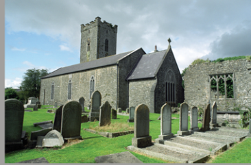
Eaglais Phádraig / St. Patrick's Church.