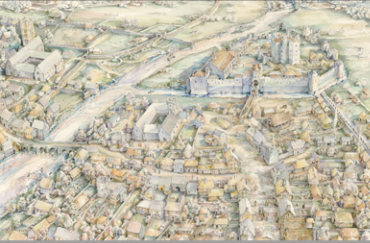
Amharc ar Bhaile Átha Troim c. 1400 / View of Trim c. 1400.