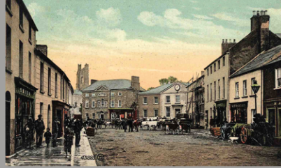
Sráid an Mhargaidh, Baile / Market Street Trim.