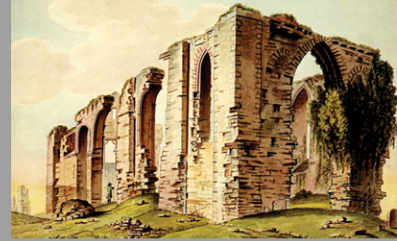
Eaglais Mhainistir Agaistíneach / The church of the Augustinian Priory.